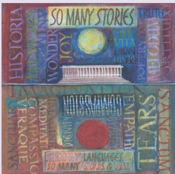
And all those words that began so far away ... are waiting for you ... in the library